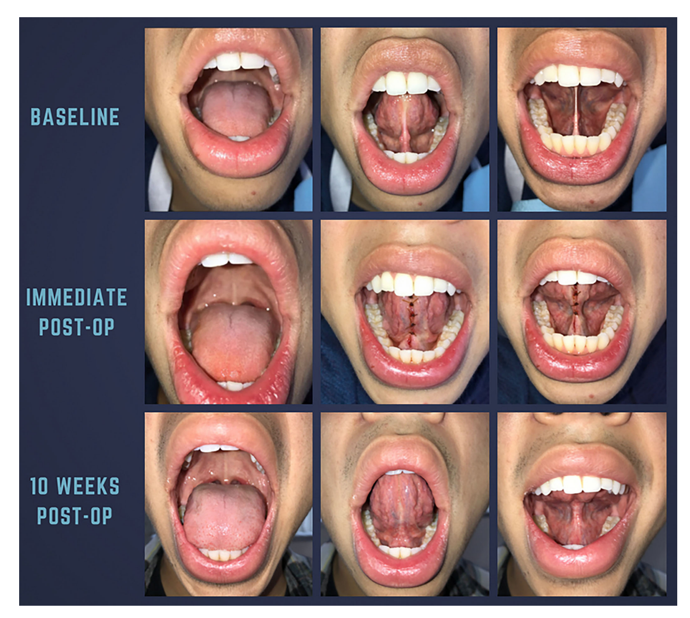
Fig. 1. Case example: 19-year-old man presenting with mumbling, drooling, unrefreshing sleep, fragmented sleep, and chronic mouth breathing associated with grade 3 functional ankyloglossia (<50% mobility of the tongue-tip to the incisive papilla compared to maximal incisal opening). Note the compensation patterns of floor of mouth elevation and tension on the attached gingiva due to the restrictive lingual frenulum. Baseline images obtained after preparation with preoperative myofunctional therapy, immediately prior to surgical release. Immediate postoperative images show excision of the mucosal frenulum and submucosal myofascial fibers with primary intention closure using 4–0 chromic suture. Note the release of tension from the floor of mouth and attached gingiva, as well as the improved tongue mobility. Photos are taken in neutral position, tongue elevated to the central incisors, and while in suction-hold (i.e., lingual-palatal suction, "cave").

tongue mobility were present and identified in 36.1% of cases (Fig. 2). There were 11.7% (n=41) of patients who had a prior frenectomy elsewhere with persistent restrictions to tongue mobility (Fig. 3).