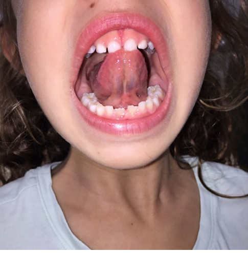
Fig. 2. Case example: 6-year-old girl with restless sleep, nail biting, dental grinding, and open mouth breathing presenting with grade 3 compensating to grade 2 tongue mobility. The image on the left shows <50% mobility (grade 3 TRMR) with floor of mouth elevation and tension on attached gingiva. The image on the right shows 50%–80% mobility (grade 2), however, the patient exerts extensive strain from the floor of mouth and muscular neck to compensate for the restricted tongue mobility.

3.3 \pm 2.6 days with severity rating of 6.5 \pm 1.9 (VAS: 0–10, mean \pm SD). Severity of pain was most highly associated with depth of the surgical dissection and extent to which restrictions of the genioglossus muscle were released. Other factors associated with pain severity include: low tongue tone, less than ideal preoperative myofunctional therapy compliance, prior myofascial pain syndromes, and patient declining to take postoperative pain medications.