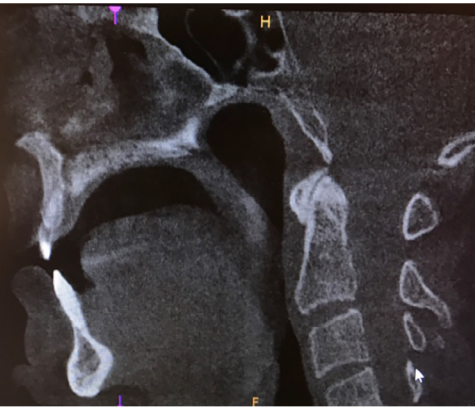
Fig. 4. Use of computed tomography imaging to assess for tongue space in the assessment of candidates for lingual frenuloplasty. The midline sagittal image reconstruction of the CT scan is used to assess the available space for the tongue in the oral cavity. Note that despite both patients having similarly restricted amount of posterior airway space, the patient on left has no space between the tongue and the palate (poor candidate), while the patient on the right has a significant amount of space between the tongue and the palate (better candidate). Lingual frenuloplasty and myofunctional therapy are considered to be less effective in patients without adequate oral volume for tongue space. Such patients may be better suited to dental orthopedic remodeling (orthodontics and/or orthognathic surgery for expansion and advancement of the skeletal framework) to increase the tongue space in addition or prior to treatment with lingual frenuloplasty.

Techniques for reeducation of the orofacial muscles were published in French in the 1990s. Even so, many thought leaders were slow to adopt these principles citing a lack of randomized control trials and high-level evidence-based research. Renewed interest for myofunctional therapy was garnered with a series of randomized control trials and cohort studies investigating the role of oropharyngeal exercises, speech therapy, myofascial reeducation, and oronasal rehabilitation for adults and children with sleep-disordered breathing. Furthermore, a more recent series of meta-analysis, review articles, shows, shows, commentaries, and position statements have catapulted myofunctional therapy to the forefront of the attention within dental and medical communities, albeit not without criticism.