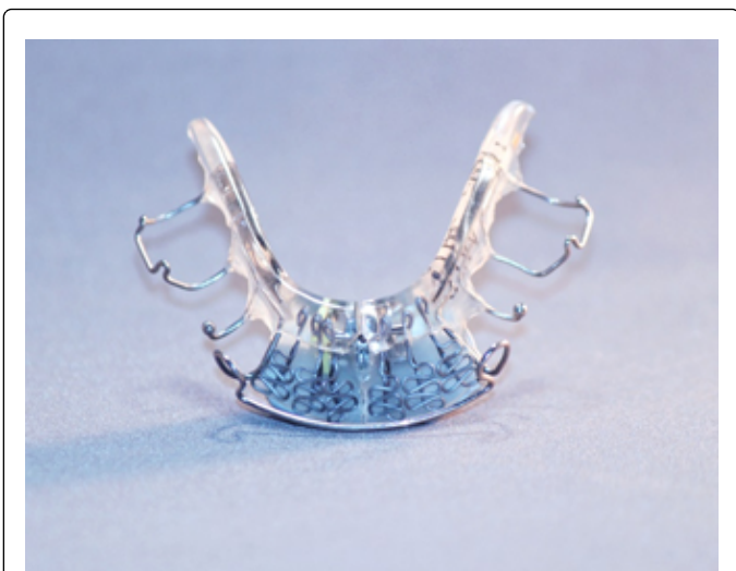
Figure 3: A lower biomimetic appliance (DNA appliance®) with anterior 3-D axial springs™, a midline screw, retentive clasps and a labial bow that was prescribed for the non-mandibular advancement half of the study population.

between 1 to 3 months after the upper appliance unless the subject was wearing the biomimetic appliance design that incorporated the mandibular repositioning nighttime component at the outset (Figure 2). Every 3 months, the overnight sleep studies were repeated. The post-treatment sleep tests were done with no appliance in the mouth and were interpreted by a medical physician. The mean apnea-hypopnea index (AHI) of the study sample was calculated prior to and after BOAT, and the findings were subjected to statistical analysis, using paired t-tests.